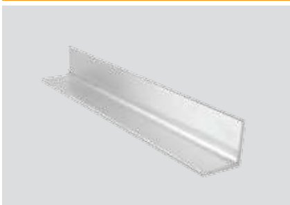
Equal & Unequal Angle: